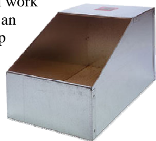
Commercial Nest Box

heat and moisture to escape. If you use a metal box, use one with a removable wooden bottom. Metal floors are cold and slippery. Metal floors contribute to chilling of the litter and spraddle legs. Don't use them.